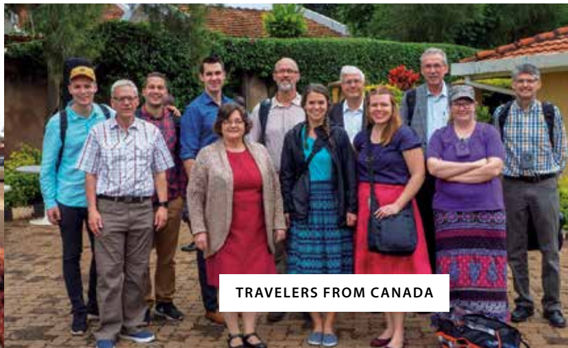
TRAVELERS FROM CANADA