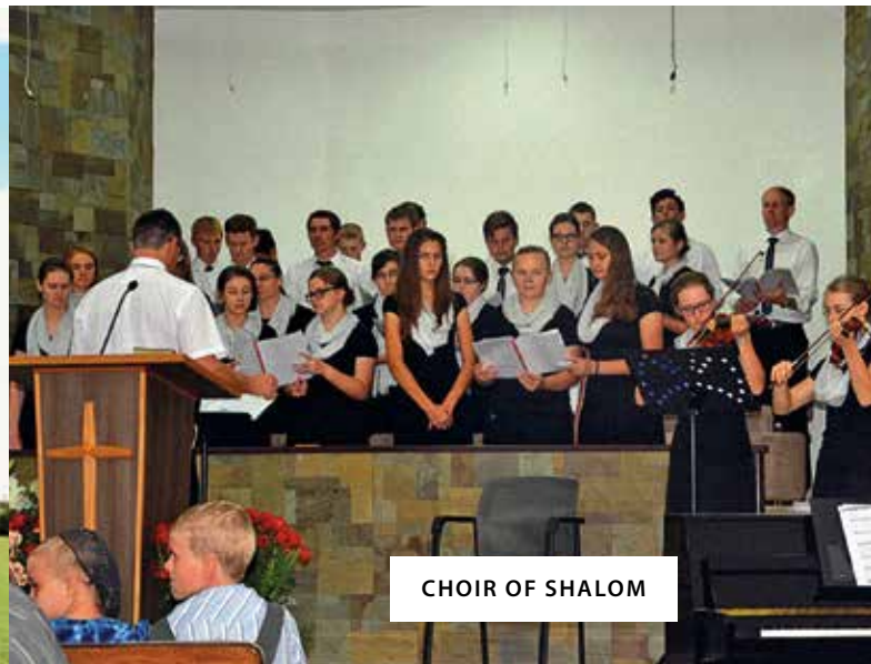
CHOIR OF SHALOM