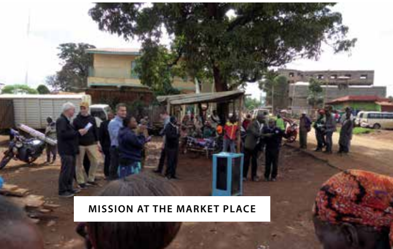
MISSION AT THE MARKET PLACE