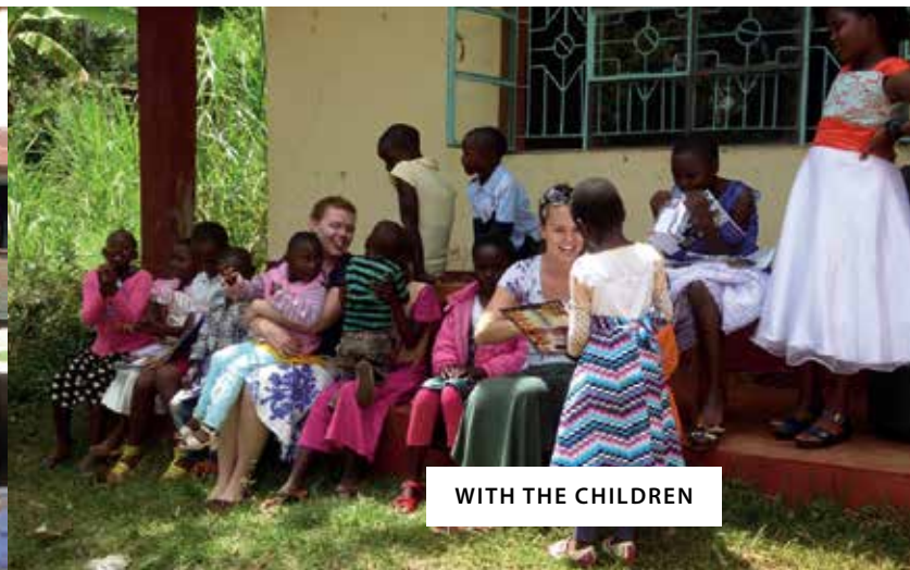
WITH THE CHILDREN