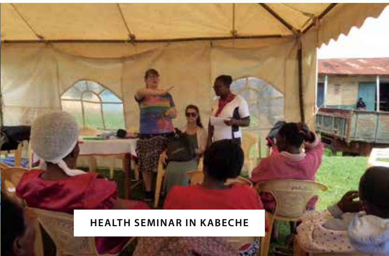
HEALTH SEMINAR IN KABECHE

There are presently sixteen congregations of the Church of God that we have fellowship with. We conducted worship services in seven locations. Some of these congregations are in remote areas. The aggregate average attendance of these congregations is 1,700 adults plus children. God has blessed His work over the years. To Him alone be the glory. Our Sisters and Brothers are eager to hear God’s Word and are very engaged in the worship services. All preaching was translated into Swahili or a local dialect. We praise God for the working of the Holy Spirit during these Services and for dear souls who sought help from Jesus. The text of a chorus that is often sung at the beginning of the Worship Services is: “There is something today in the house of the Lord. . . . There is