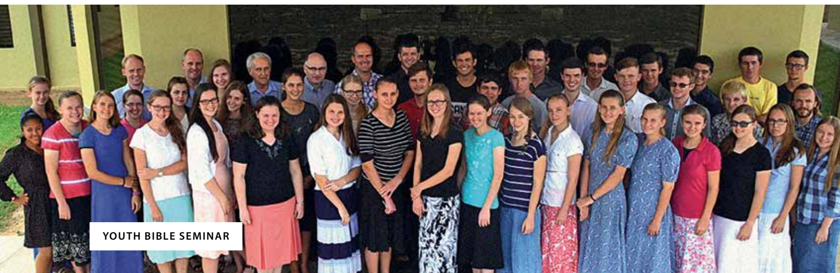
YOUTH BIBLE SEMINAR