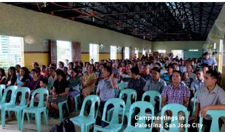
Camp meetings in Palestina, San Jose City