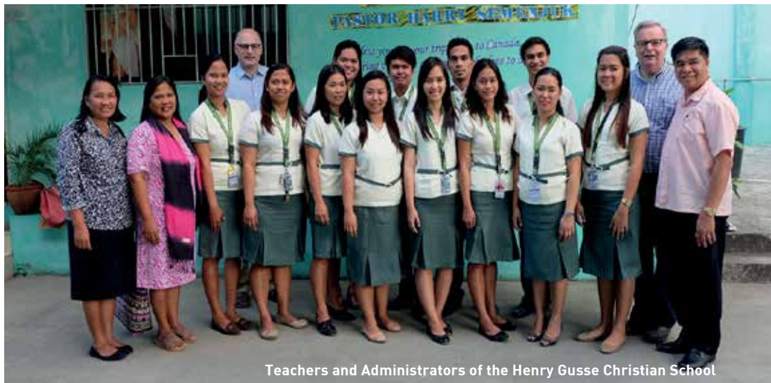
Teachers and Administrators of the Henry Gusse Christian School