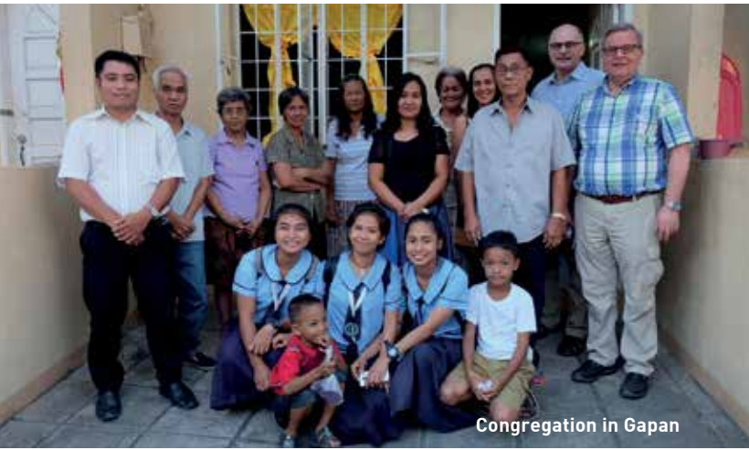
Congregation in Gapan