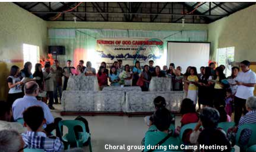
Choral group during the Camp Meetings

The congregations are primarily sustained by donors from Canada. The pastors receive monthly financial support. Church buildings, in a style we are unfamiliar with, have been erected that are for the most part plain and simple. Because there is no winter there, the church buildings often have only brick walls and a corrugated metal roof.