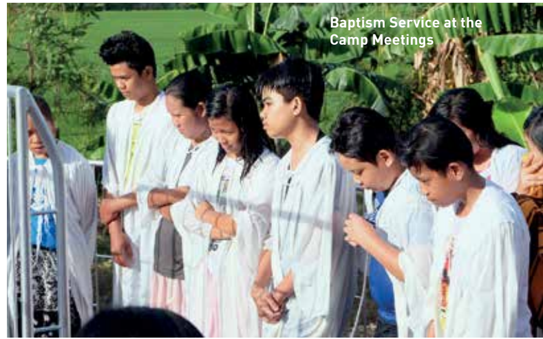
Baptism Service at the Camp Meetings

they teach the doctrine of the Bible. Through this, people repent and are added to the church. With gratitude we can say that God is acknowledging this work.