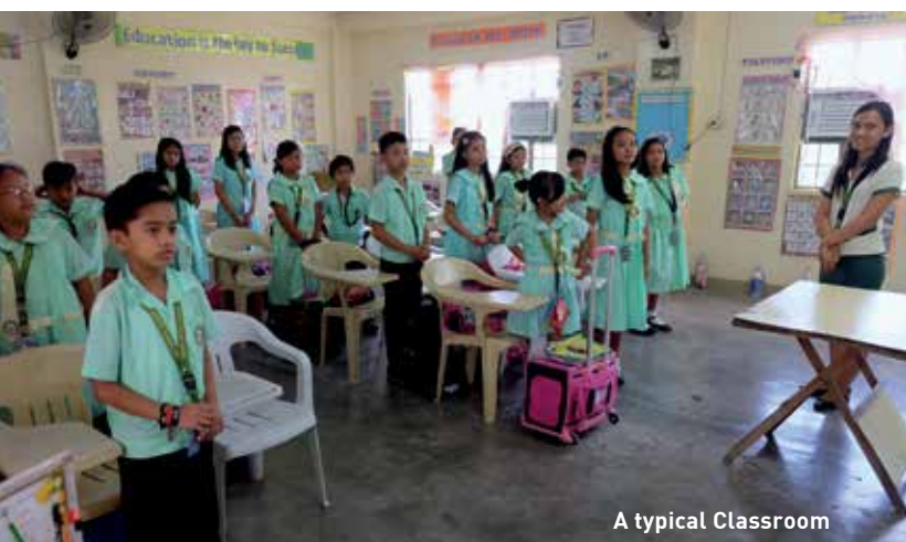
A typical Classroom