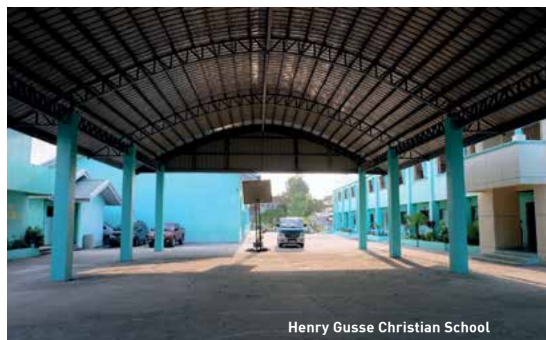
Henry Gusse Christian School