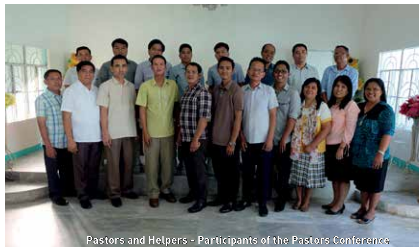
Pastors and Helpers - Participants of the Pastors Conference