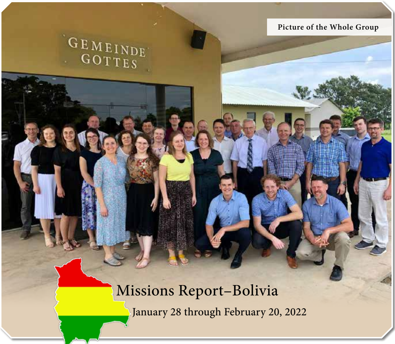
Picture of the Whole Group