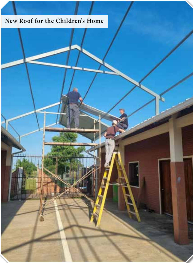
New Roof for the Children's Home

held, followed by a shared meal. In Shalom, about one hundred to one hundred twenty people, including children, gather for worship.