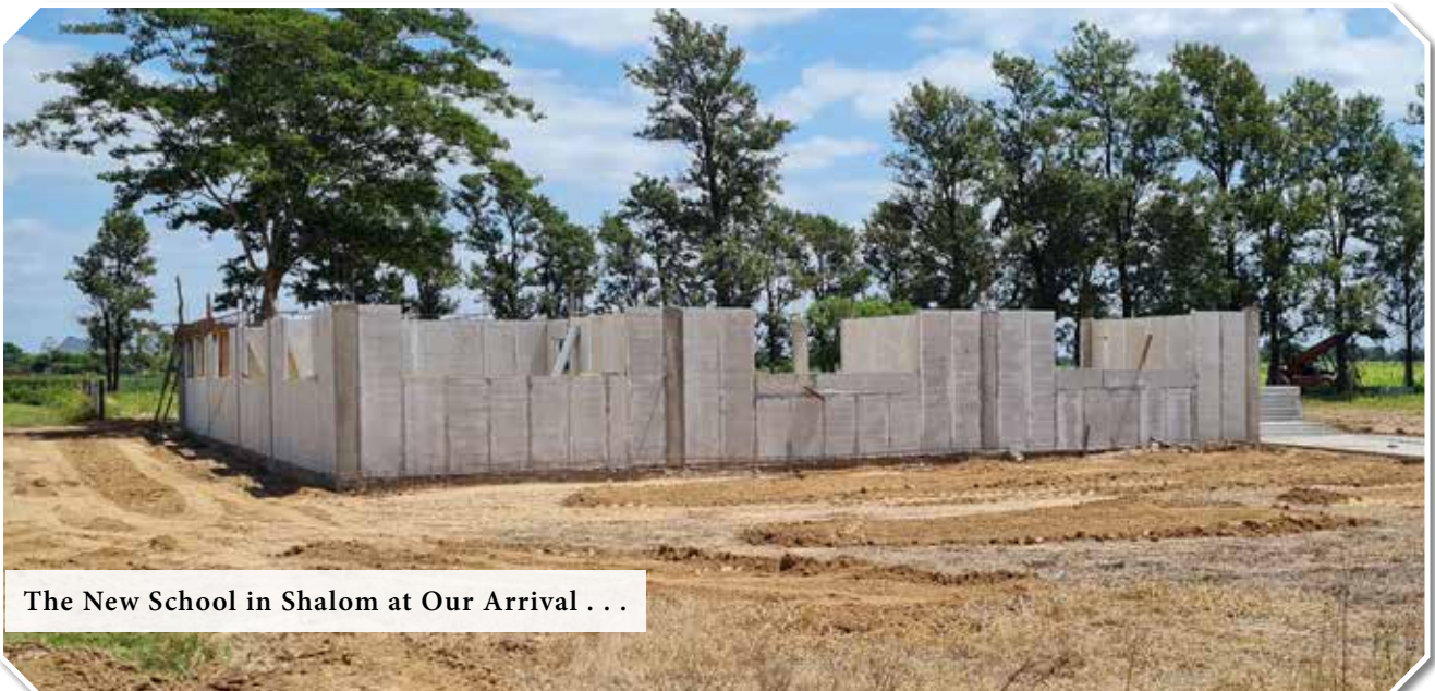
The New School in Shalom at Our Arrival . . .