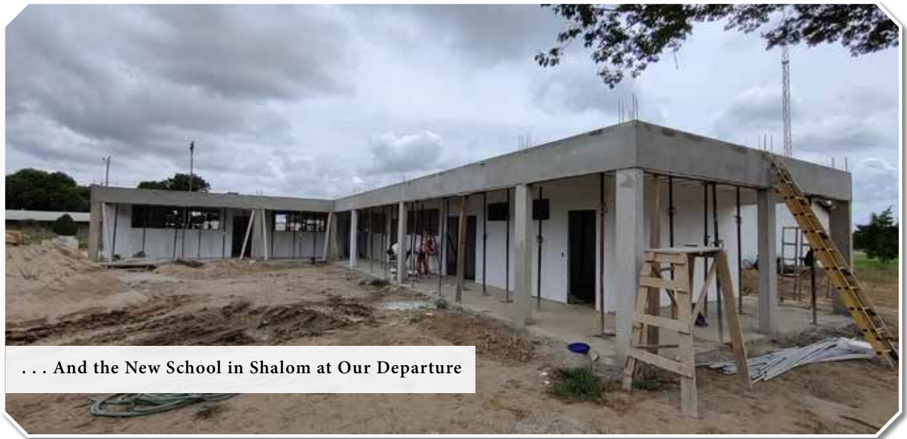
... And the New School in Shalom at Our Departure

About fifty to sixty people gather in Via Gracia for worship services. In these services, three brothers and sisters from Germany participated with songs. In addition, three sisters conducted Vacation Bible School sessions for the children. They were divided into three different age groups, and the sessions continued for several days.