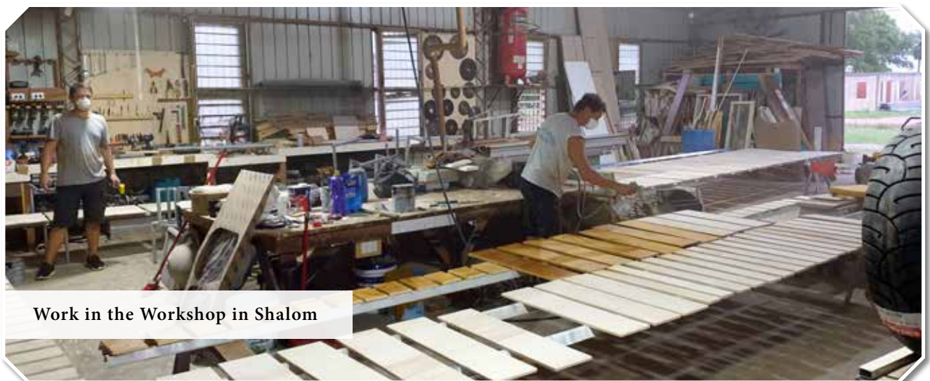
Work in the Workshop in Shalom

We were divided into two groups to do work in the Children’s Home and in Shalom. In the Children’s Home, a roof was installed over an inner courtyard, and solar panels were then applied to the roof. A second project there was to convert a residence for the staff into two apartments, with new plumbing, bathrooms,