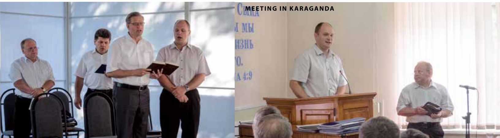
MEETING IN KARAGANDA