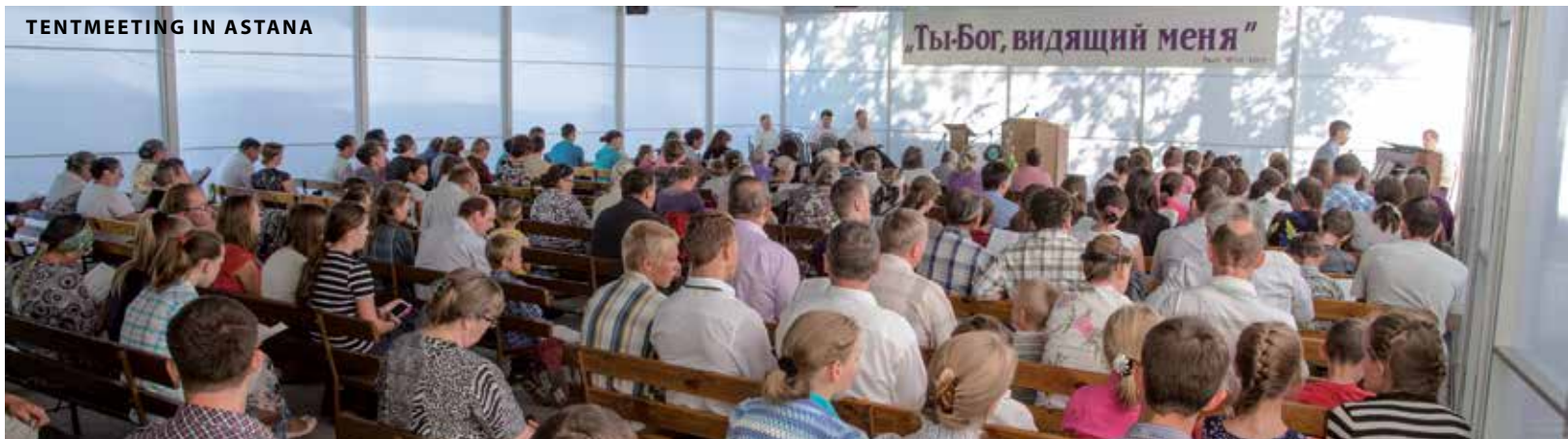
TENTMEETING IN ASTANA

In the past years the brothers and sisters in Astana had been visiting a prison in the capital city and holding ser-